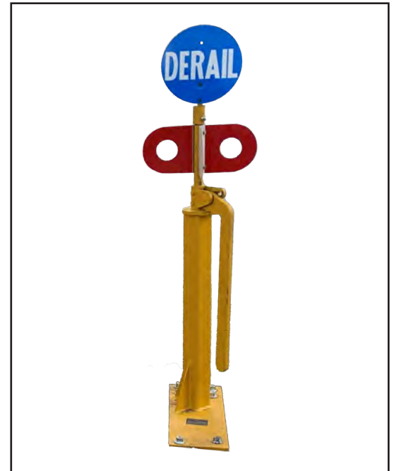
LSE-2A with BF-2D NOTE: Flag Sold Separately