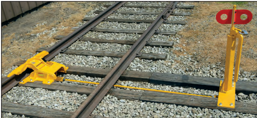
SD-5 with LSE-2 and RA1566-2B (each sold separately) NOTE: Padlock not included