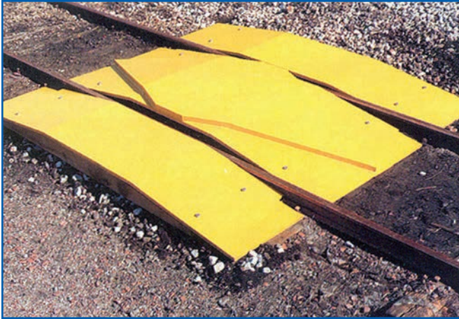
The Nolan Company's PAR-1 Bi-directional Rerailer installed on track.