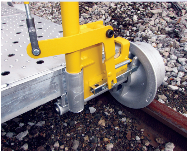
▲ ATS cart showing close-ups of Nolan's dead man brake system ►

IMPROVES SAFETY on FLAT TRACK and TRACK GRADES Cart immediately stops upon handle release